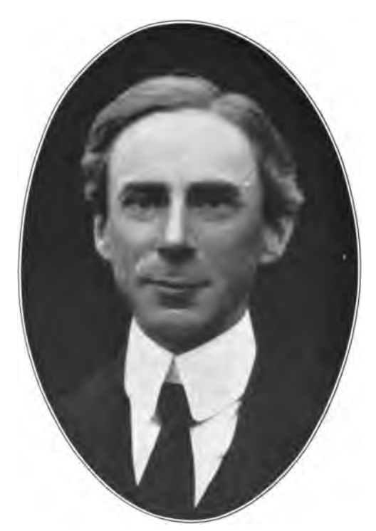
HONORABLE BERTRAND RUSSELL AUTHOR OF JUSTICE IN WAR TIME