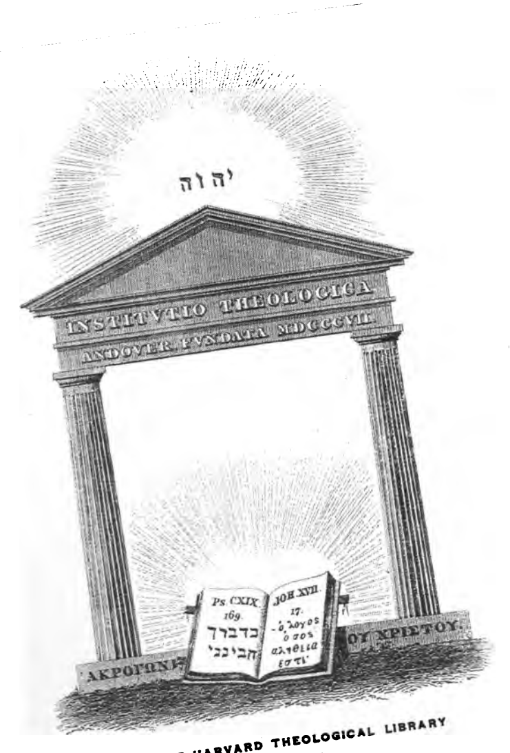
ANDOVER-HARVARD THEOLOGICAL LIBRARY M D C C C C X CAMBRIDGE, MASSACHUSETTS